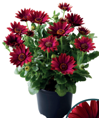
DIXIE IMP. Classic