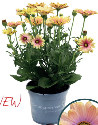
NEW KEVA Classic