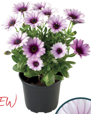
NEW KLAUDIA Classic