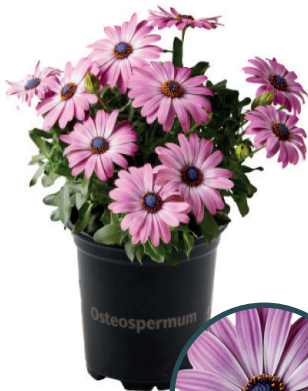
VIOLET HALO Classic