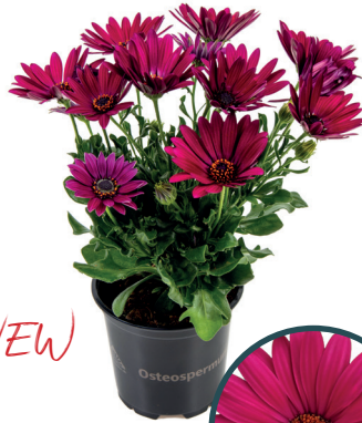
NEW KYLIE Classic