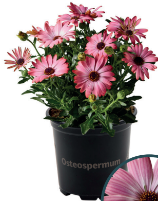
HOT PINK HALO Classic