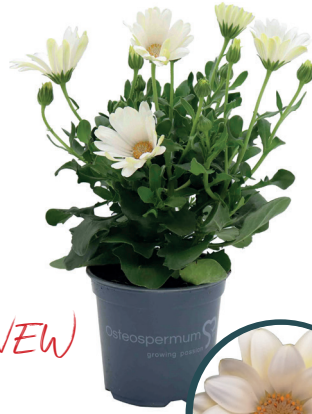
NEW KATERINA Classic