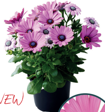
NEW KAIA Classic